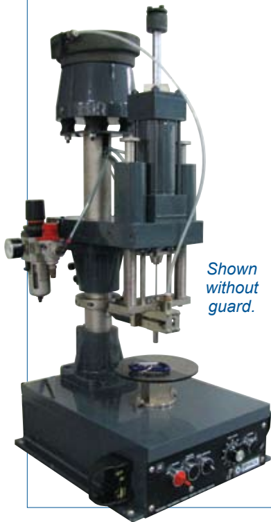
Shown without guard.

Productivity is significantly enhanced and installation quality is dramatically improved.